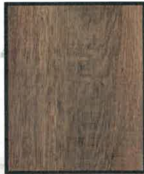
MELVIN BROWN LVP