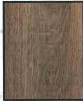
MELVIN BROWN LVP